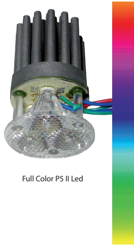
Full Color P5 II Led