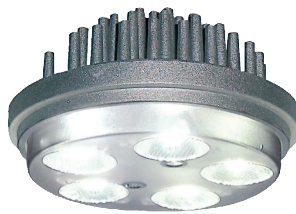
Full Color P5 II Led