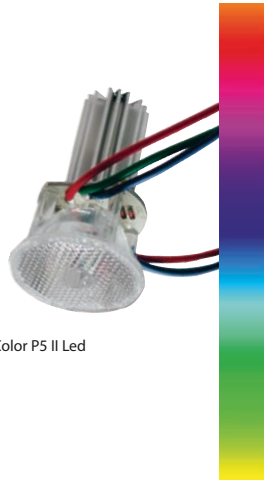
Full Color P5 II Led