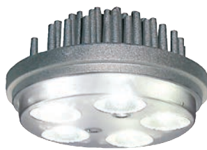
Full Color P5 II Led